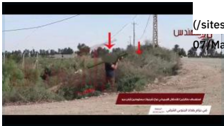
Figure 2: May 23, 2020, LTM video purporting to show the event in which a Chinook was targeted