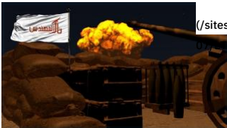
Figure 3: LTM graphic from July 7, 2021