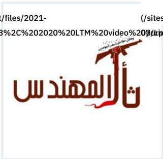
Figure 3: Liwa Thar Muhandis logo