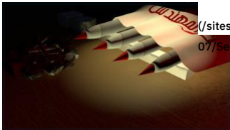
Figure 4: Second LTM graphic from July 7, 2021