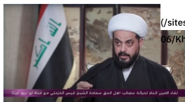
Figure 1: Qais al-Khazali's interview with INEWS TV, June 1, 2021

Qais al-Khazali, leader of Asaib Ahl al-Haq (/node/16715) (AAH), keeps trying to portray himself as a strategic ally of Iran, not a proxy. He reiterated this view in a June 1 interview (https://www.youtube.com/watch?v=BT0IjH8YbMg&ab_channel=%D8%AC%D8%A7%D8%B3%D9%85%D8%A7%D9%84%D8%A8%D8%B5%D8%B1%D8%A7%D9%88%D9%8AJasimalbsrawi) : "I have a lot of evidence showing my stance is [based on] national [interest]...If [the Americans] promise to withdraw, we'll accept the result of the negotiations [with the Americans], which will be carried out by a mediator and won't have anything to do with the nuclear negotiations...If Iran was deciding for me, I would've said: 'I'm not able to negotiate, I need to see what Iran wants, what they agree on'" (Figure 1). He also recently claimed to have told Esmail Qaani, the commander of Iran's Qods Force, not to ask him to stop attacks on U.S. forces in Iraq.