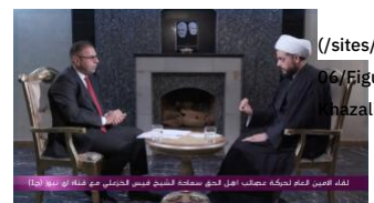
Figure 1: Qais al-Khazali's interview with iNEWS TV, June 1, 2021

Khazali continued: "The truce is over...now it's war...Except for the American embassy...and Balad base...any U.S. military presence is targetable by the fasail [armed groups] of the Iraqi muqawama , and the decision is to escalate the operations in terms of quantity and quality." In November 2020, he offered similar comments about the end of the truce (https://www.washingtoninstitute.org/policy-analysis/their-own-words-senior-leaders-admit-membership-tansiqiya) , indicating that his militia was one of the groups behind attacks against U.S. forces and interests: "We said that our decision is to escalate and even to resort to special operations...Right now, our purpose is to make the Americans believe that we have the ability and weaponry to not allow them [to stay in Iraq], and they will find out that the cost of keeping their forces in Iraq is very high."