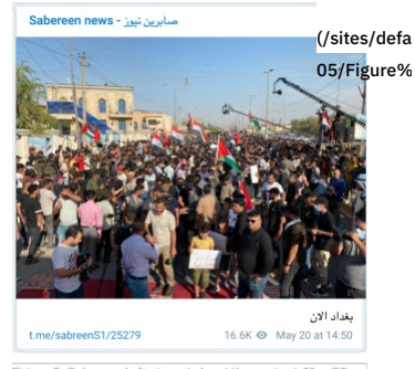
Figure 5: Sabereen's first post about the protest, May 20, 2021.