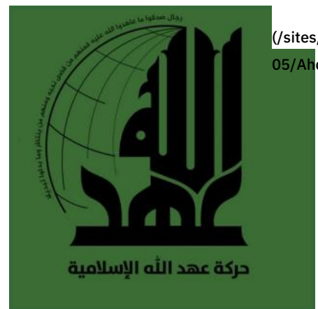
Ahd Allah logo