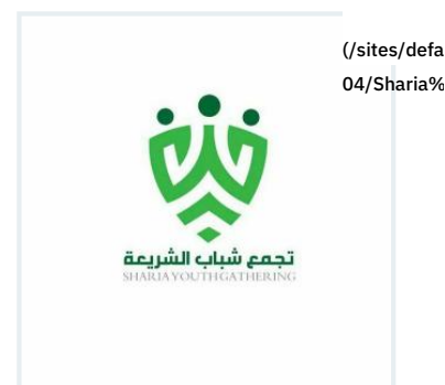
Sharia Youth Gathering logo