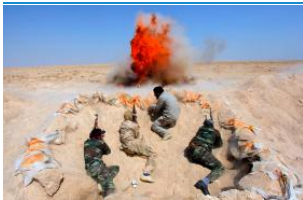
How to Use Militia Spotlight: Profiles (/policy-analysis/how-use-militia-spotlight-profiles)