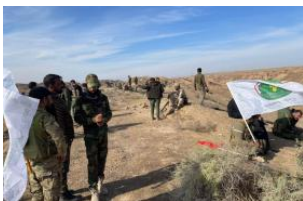
Profile: Badr Organization (/policy-analysis/profile-badr-organization)