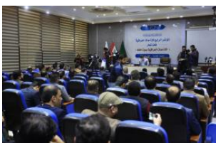
Profile: The Iraqi Radio and Television Union (/policy-analysis/profile-iraqi-radio-and-television-union)