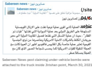
Sabereen News post claiming under-vehicle bombs were attached to the truck inside Jirishan point, March 30, 2021.

The third video was posted via muqawama social media on March 25, 2021, purportedly showing a roadside bombing in Radwaniyah southwest of Baghdad. It, too, fails to indicate any real damage.