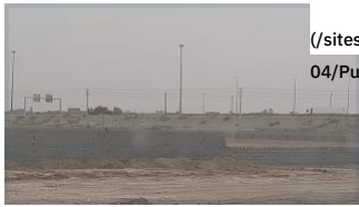
Purported attack by MD at Falluja Bridge, March 11, 2021.

The group has also published four videos of such attacks. The first apparently shows an attack on a logistical convoy at a traffic junction just west of Baghdad (Fallujah Bridge) on March 11. Judging from the angle of the device (toward the back end of the vehicle and away from the driver), MD is trying to reduce lethality to avoid backlash from the Iraqi public.