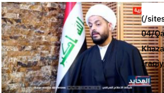
Qais al-Khazali, al-Iraqiya TV, November 19, 2020