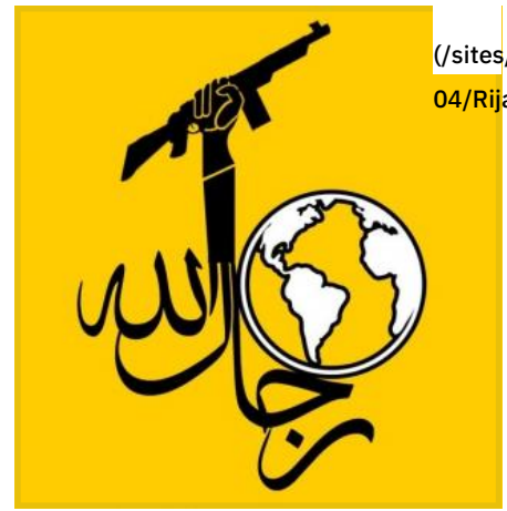
Rijal Allah logo

At exactly 23:50 hours on 4/22/2021, your sons in the Men of God [Rijal Allah] faction were able to target the American occupation base in Baghdad (Victoria) with eight 107mm rockets that hit the targets with high accuracy. This is the base in which the U.S. occupation takes refuge from our anger, and we promise you we will pursue them so that its protection is no protection from God's command." [note: "Victoria Camp" is the preferred muqawama term for U.S. forces at Baghdad