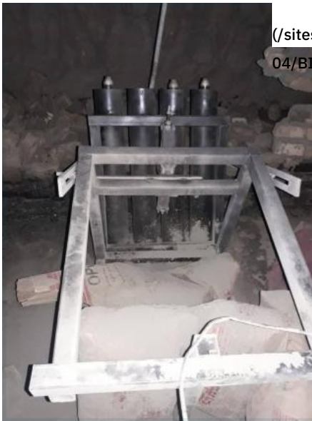
Baghdad Airport rocket launcher, April 22, 2021. Note the three unlaunched rockets.

The statement inaccurately claims that eight rockets hit targets. Although the perpetrator attempted to fire eight rockets, only three were successfully launched, the remainder failed to fire.