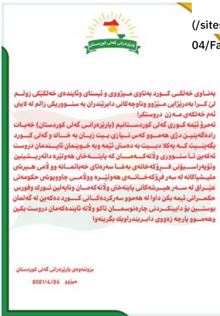
Fake claim of the Baghdad Airport attack by "Protectors of the People of Kurdistan."

("Faction of the Men of God") (/sites/default/files/2021-04/Fake%20Kurdish%20message.JPG) posted a Quranic verse, followed a minute later by an Arabic