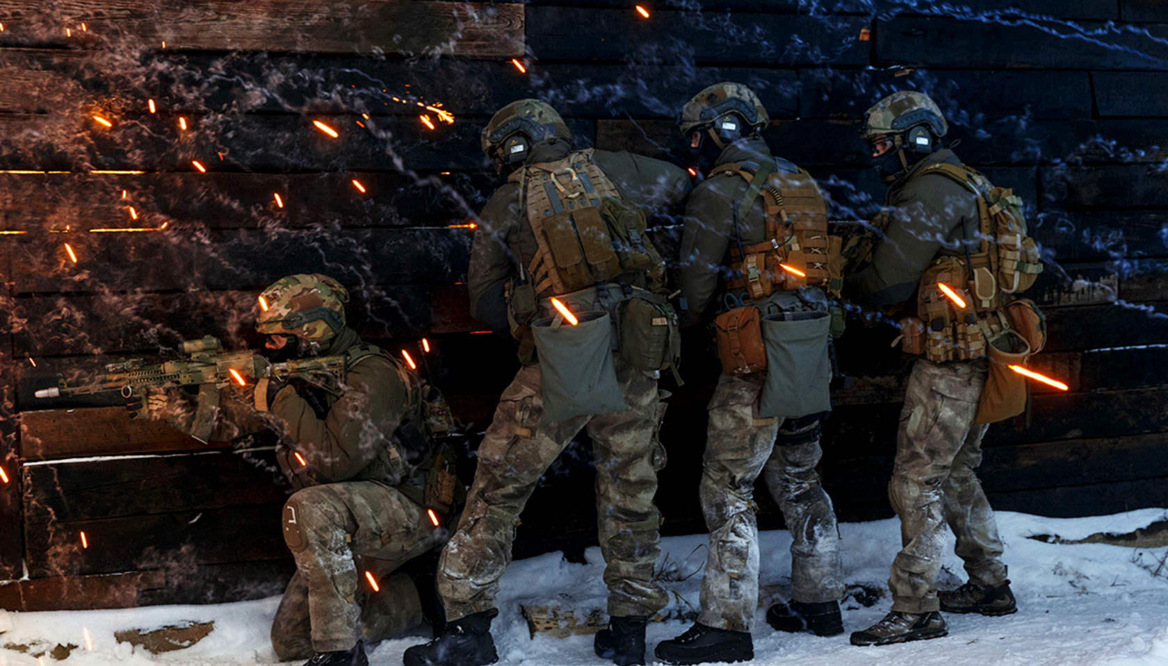
Special Operations Forces Command

theaters of war.” 32 The SOF has other unique features. According to Sukhankin, they are “able to collaborate with local military formations,” and are able to operate in smaller tactical groups, but without formal approval from the armed forces. The SOF are part of the story when it comes to understanding the origins of Russian PMCs under Putin, even as the SOF is formally part of the Russian armed forces. This model continued to expand and modify in the coming years.