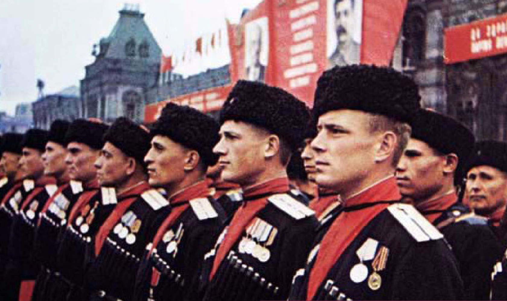
Kuban Cossacks at Victory Parade, Red Square, June 24 1945.

The use of PMCs in Vladimir Putin's Russia that emerged in recent years is not new, but builds on centuries-long Russian practice.