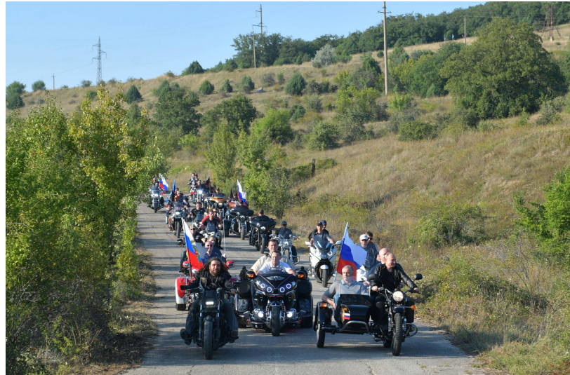
President Vladimir Putin with Night Wolves Motorclub