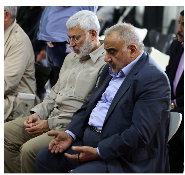
Abu Mahdi al-Muhandis, left, a commander in the Popular Mobilization Forces, and Adil Abd Al-Mahdi, right, then Minister of Oil and now Prime Minister of Iraq, attend the funeral of Iraqi politician Ahmad Chalabi, in Baghdad, Iraq, on November 3, 2015.

PMF Basra Operations Command, both led by Badr commanders. 98 These commands appear to be maintained by Badr in readiness for any of a number of contingencies: the deployment of Badr PMF units to restore order during electricity-related or secessionist rioting, to deliver civil engineering and disaster relief, or to crack down on uncontrolled militias. <sup>t</sup>