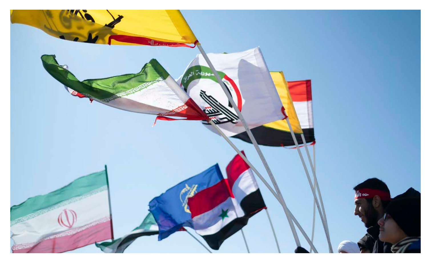
Photo above: Iranian men hold Iraqi Popular Mobilization Forces (C), Iran, Iraq, and Islamic Revolutionary Guards Corps (IRGC) flags while taking part a rally to mark the Islamic Revolution anniversary in Azadi (Freedom) Square in western Tehran on February 11, 2020.