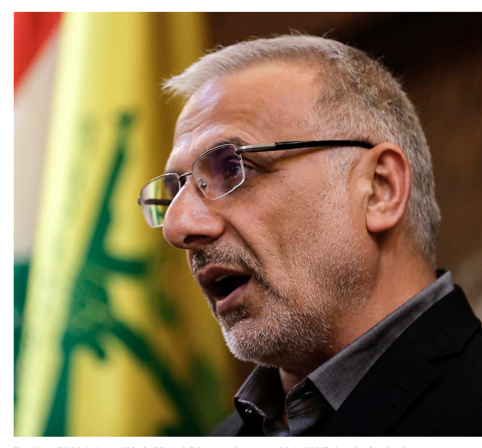
Photo above: Ali Mekdad, Lebanese MP for the Shiite Hezbollah party, speaks to press on July 11, 2019. The lawmakers from the Lebanese Shiite movement condemned U.S. sanctions against three of its officials, saying they would "change nothing" in the group's rejection of U.S. policies in the region.

"Hezbollah is both part of and above the sectarian political party system in Lebanon, participating in the system from within and functioning as a non-state actor pursuing its own goals, independent of and often at loggerheads with those of the central government."