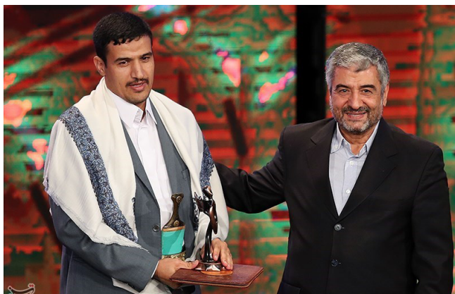
IRGC COMMANDER MOHAMMAD ALI JAFARI GIVES ABDUL-MALİK AL-HOUTHİ THE “RESISTANCE” AWARD FOR 2016.

its support to the Palestinian movement in the 1990s, the arrangement has had its ups and downs. Although both sides adhere to Islamist ideology and consider “resistance” the main strategy to confront Israel, sectarian differences have always hampered and limited cooperation. All the same, Iran has supplied Hamas with various weapons, technical knowledge on rocket development, and advanced training and money for the group’s political and military wings. Recently, the Israel Defense Forces estimated that around 50 percent of the budget for Hamas’s military wing comes from Iran, with Iran giving a combined $70 million to Hamas and Palestinian Islamic Jihad in a year. 33 Historically, the main route for smuggling arms was through Sudan, Egypt, and into the Gaza Strip. Smuggling by sea was more challenging, and some Iranian shipments were intercepted by Israel, probably en route to Sudan and Gaza. 34 In 2011, Israel seized fifty tons of weapons, including mortars and antiship missiles, aboard the MV Victoria , and in 2014 it seized another shipment, which included M-302 rockets (with a range of up to 200 kilometers), from the Klos C . 35