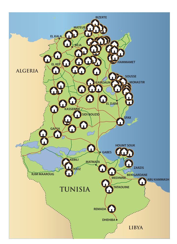
MAP 1 Origin of Tunisian fighters per IS border documents. CLICK ON MAP TO ZOOM IN.

Keeping in mind these imperfections, the data is especially useful as it relates to facilitation networks. The information in the IS border documents helps elucidate where and how Tunisians moved from Turkey into Syria (see Map 2). Particularly interesting is the revelation that the IS infrastructure spanned both the Turkish and Syrian sides of the border, with Tunisians checked on both. Thus, while IS did not control or claim territory in Turkey, it did man a vital parastatal point of